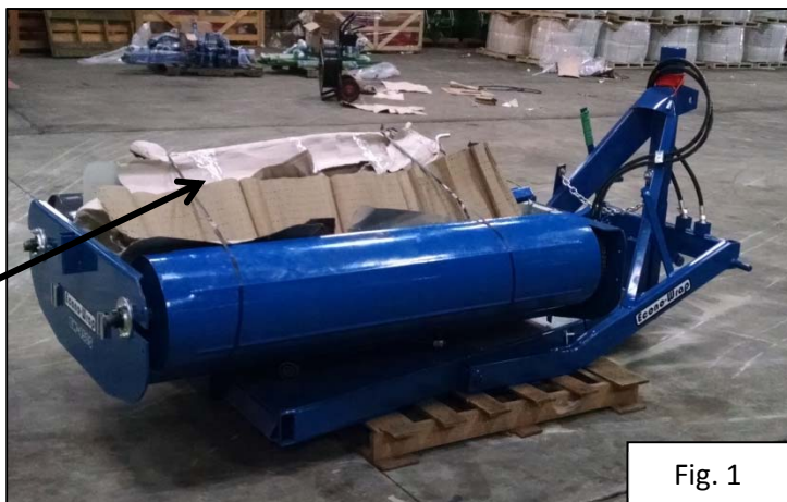
Fig. 1 shows how unit should appear upon delivery. Fig. 2 shows the contents packaged from warehouse.

The following pages explain the light assembly of an EW-450S. Complete assembly should take between 8-15 minutes.